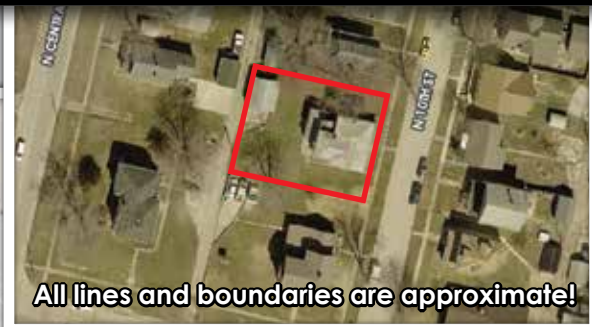
All lines and boundaries are approximate!